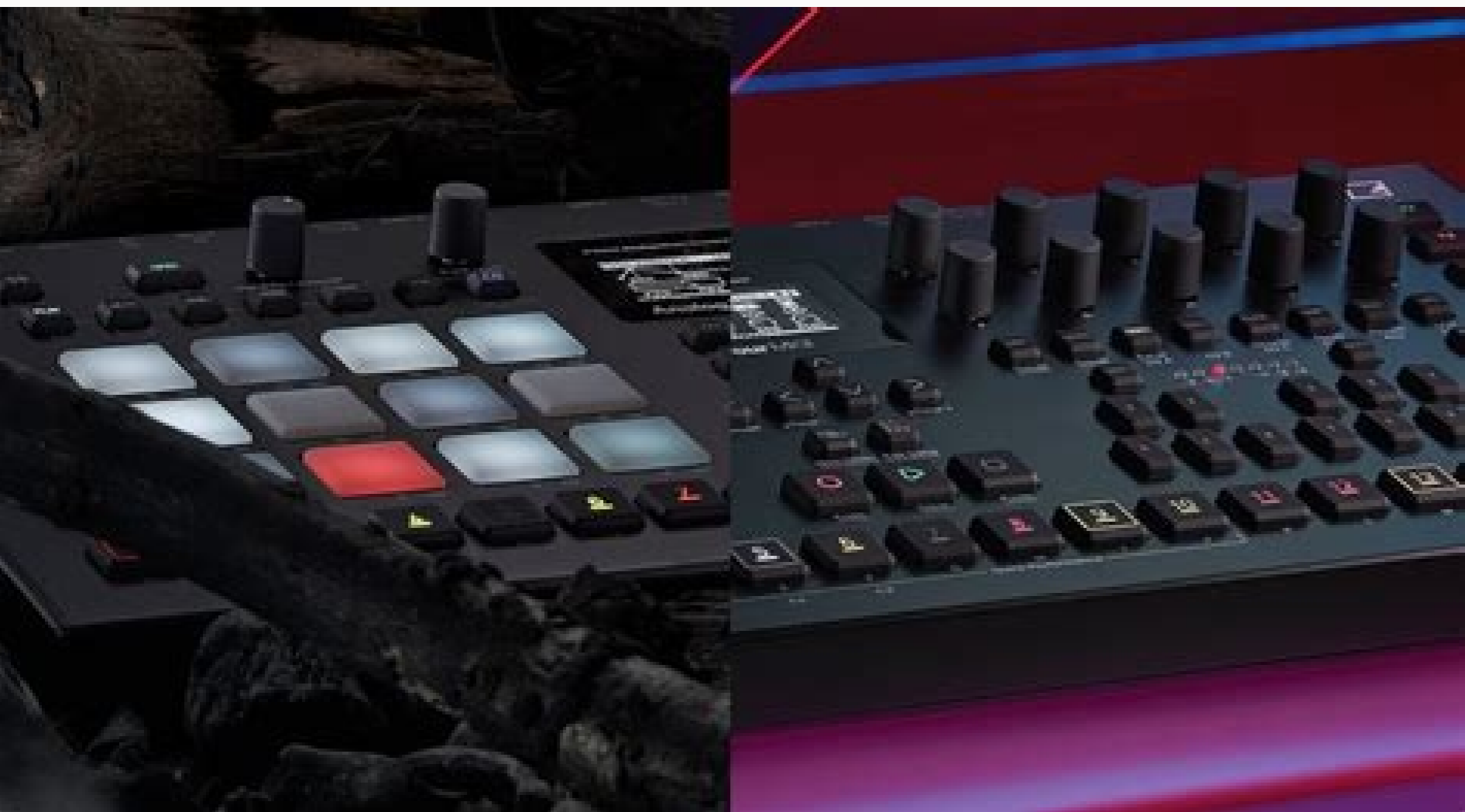
Analog four mkii manual.